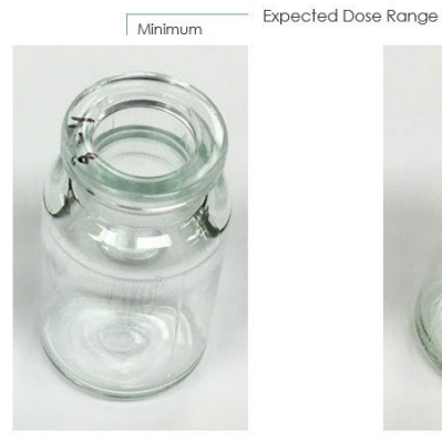
Dosage = 13.4 – 14.4 <u>kGy</u> Target Dose = 12 <u>kGy</u>