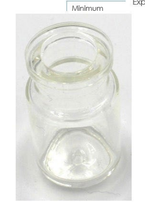
Dosage = 13.4 – 14.4 <u>kGy</u> Target Dose = 12 <u>kGy</u>