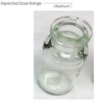
Dosage = 19.1 – 20.6 kGy Target Dose = 18 kGy